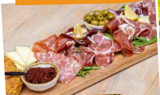
Pelle's Platter Nice to share!