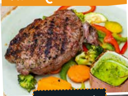
New York Strip

Our main dishes are served with fries and fresh salad.