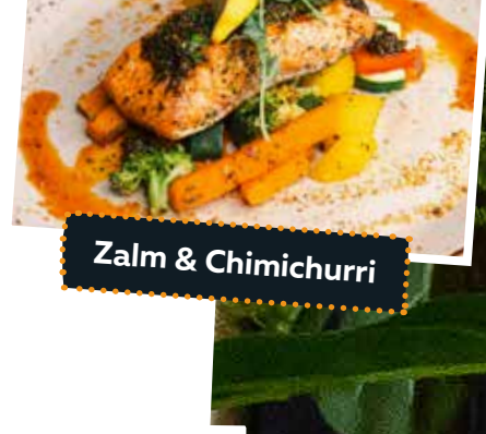
Zalm & Chimichurri