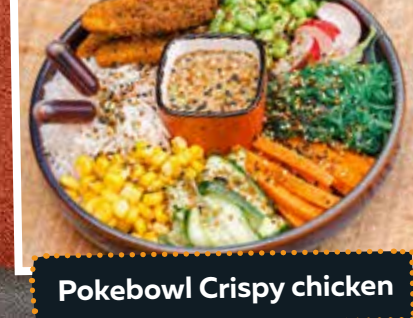
Pokebowl Crispy chicken

This Hawaiian-inspired dish includes rice, corn, carrot, wakame, radish, edamame, soy sauce, sweet-and-sour cucumber and your choice of topping!