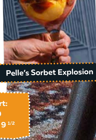
Pelle's Sorbet Explosion

In search of a refreshing ice cream sundae? Check our magazine for all scoop ice cream & soft serve specials!